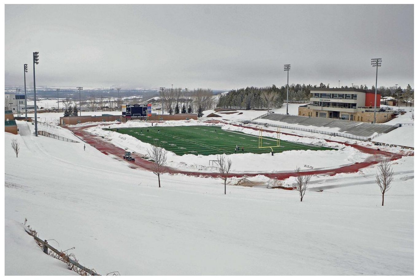
The turf playing surface at the MDU Resources Community Bowl has been cleared off, with snow lining the entire field.